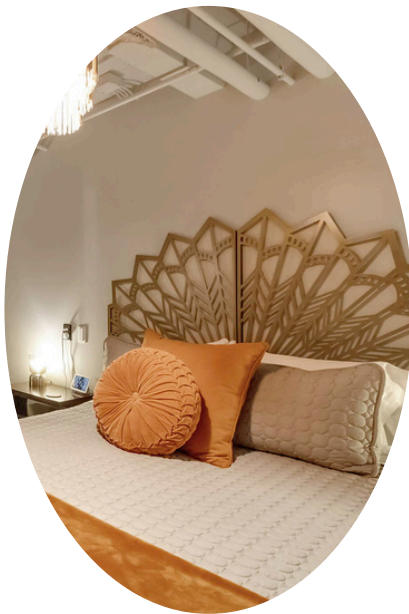
Hotel Rooms $ 1, 3 2 5 + $ 1 5 6 tax