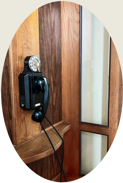
Audio Guest Book $ 3 5 0