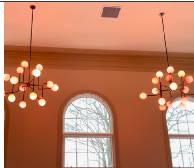
Custom LED Lighting