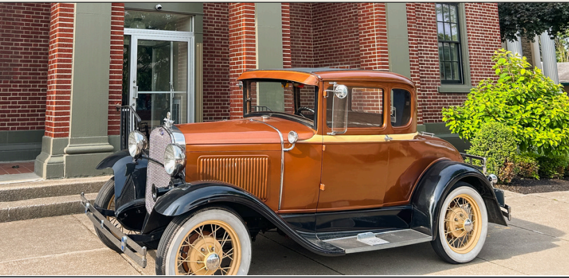
1930 Model A