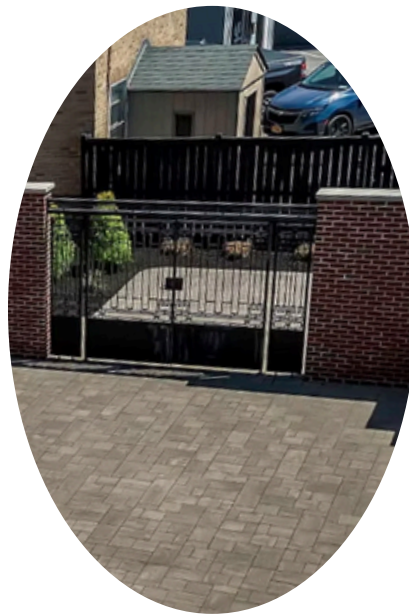
Courtyard $ 1, 5 0 0 in season only